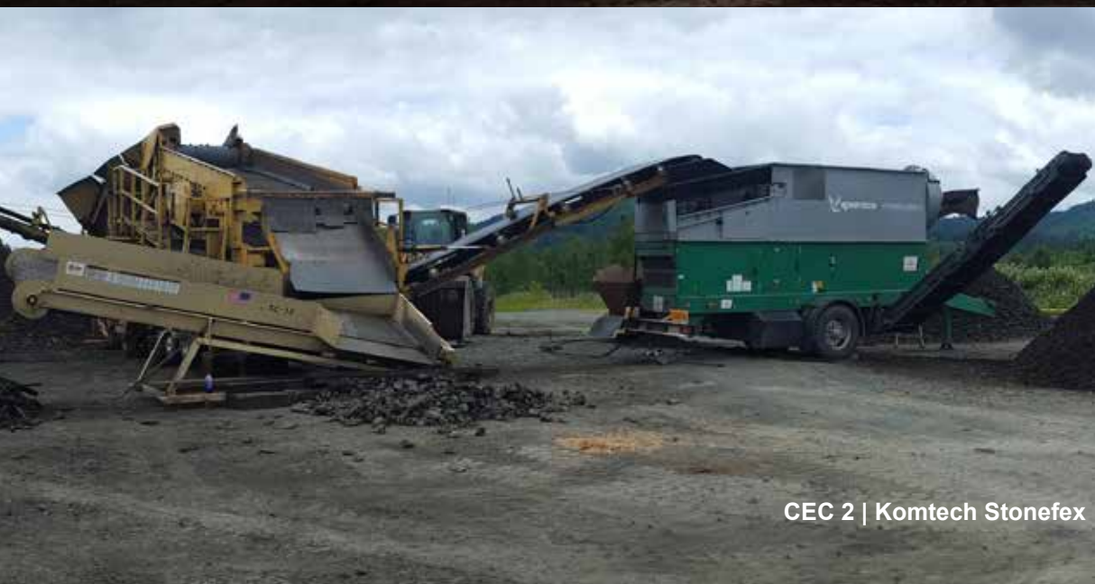
CEC 2 | Komtech Stonefex

300-400 cubic yards per hour 3 sort (2 deck) star screen with variable sizing Fines: Can set top sizing between 3/8" and 3/4" Mid Cut: from fines size up to approx. 2" Overs: 2" plus