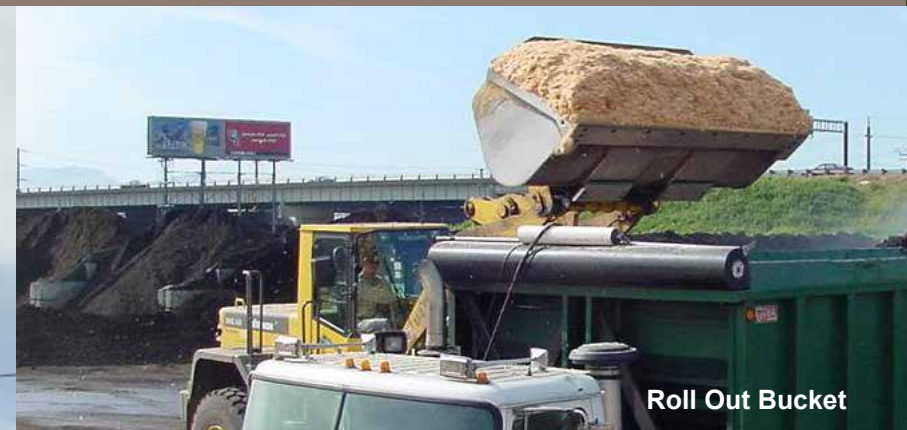
Roll Out Bucket