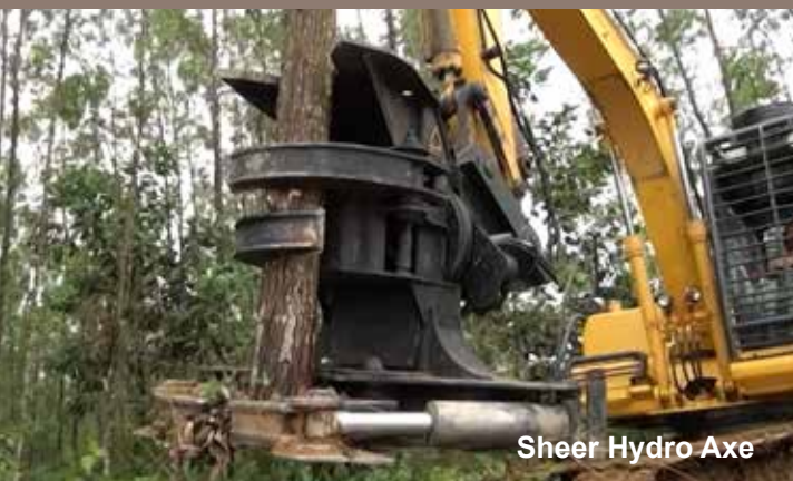
Sheer Hydro Axe