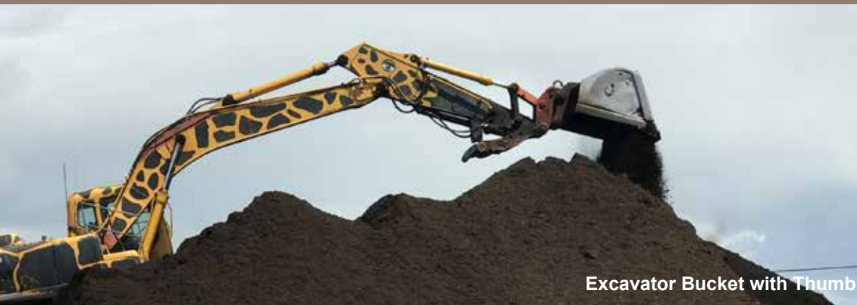
Excavator Bucket with Thumb